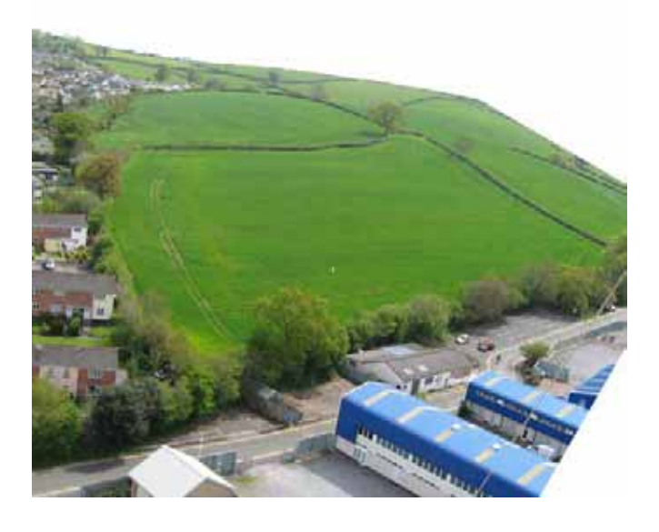
The Riverside Site

Totsoc is part of an alliance with the Town Council, Housing & Built Environment Forum, Traffic & Transport Forum and the Public Space Forum which