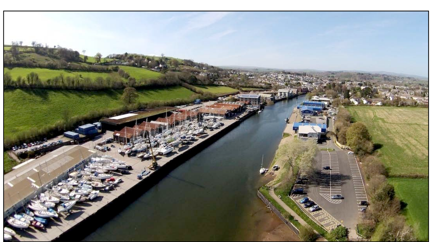
The Baltic Wharf site is seen on the left.