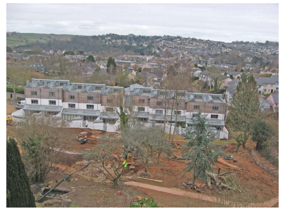
TotSoc - The Totnes and District Society

For more information about the Association and photos showing the work in progress, visit the LGA website at http://leechwellgarden.org.uk